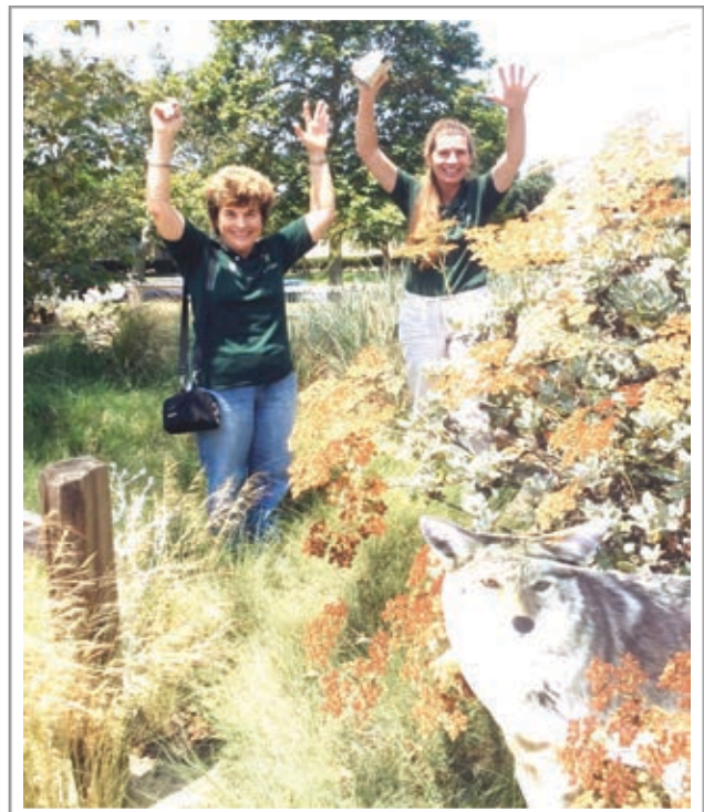
Lore and Cindy teach young children and their parents safety and hazing around coyotes.