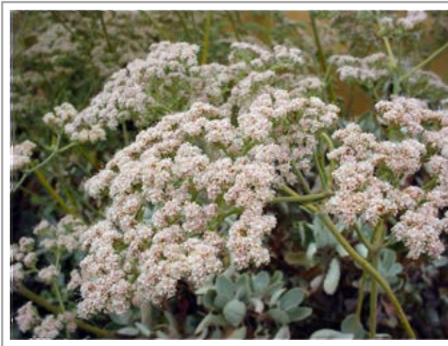
Giant Buckwheat (St. Catherine's Lace) Eriogonum giganteum