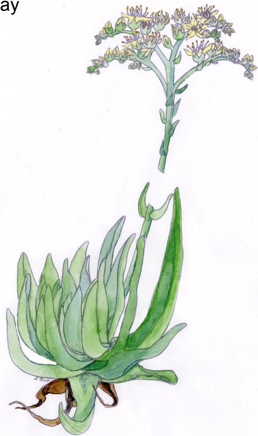
Island Green Dudleya Dudleya virens ssp. insularis

Presented by: South Coast Chapter California Native Plant Society