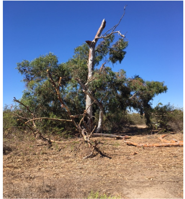
Loss of eucalyptus branch and crown in July 2021 at Madrona Marsh.

A leading theory holds that under higher humidity conditions, on calm days trees hold the moisture in the canopy -- limiting evapotranspiration, causing moisture retention and stress, and eventually leading to limb failure. Basically, sudden branch drop is the tree's response to a warm and dry environment where transpiration needs