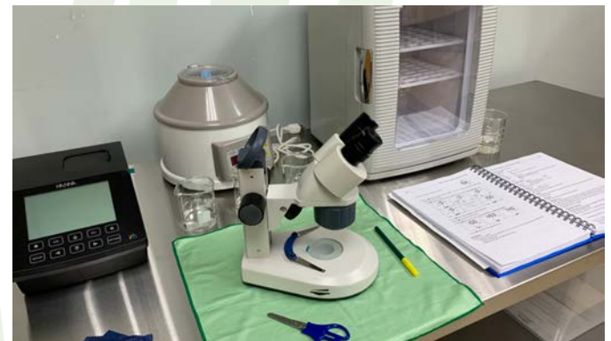
The Friends funded microscopes for water labs and supplied the curation lab for various research projects.